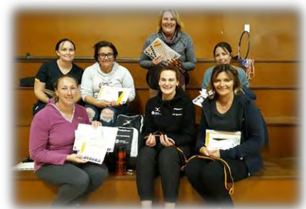
NSDWU Workshop Hokitika