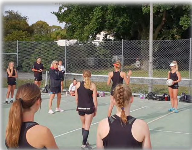
Christchurch Netball Centre, Summer Development Camp

The NM team has been working with some Centres to support their PDP sessions. These sessions provide an excellent learning opportunity for coaches, coaching alongside or observing other coaches, with the support of a coach developer.