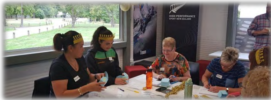
Coach Developers & Umpire Coach Developers – The Gold Nuggets of Facilitation

Our senior coach developers have been supporting of some of the new coach developers in their training by doing co- delivery of workshops and peer observations.