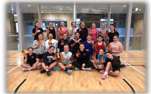
Selwyn U15 Rep Session