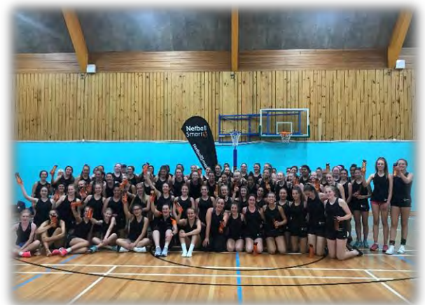
Christchurch Netball Centre, Summer Development Camp