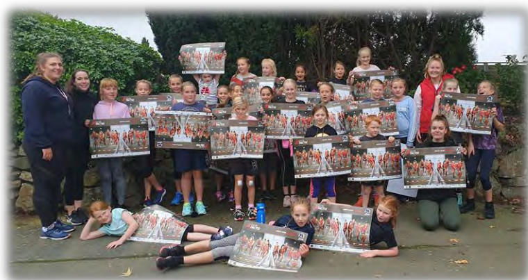
Waimate Holiday Programme

At the end of 2018, we recruited six interns from University of Canterbury and Lincoln University to carry out the 2019 holiday programme to the following Netball Centres who do not have paid development staff: Motueka, Kaikoura, Buller, West Coast, Hokitika, Hurunui, Malvern, Temuka, Geraldine and Waimate. Programmes were spread across three holidays (January, April and July) and were fitted around the crossover between school holidays and university holidays. We continued to receive positive feedback from the players, parents and the Centres involved.